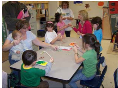
Fall Family Math Night